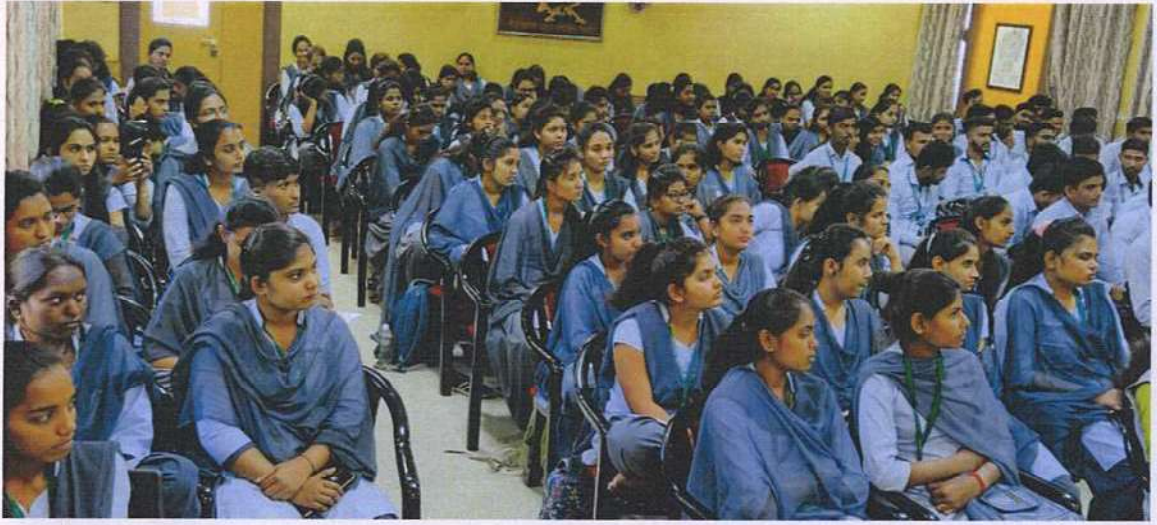
Students in Environmental Science workshop.